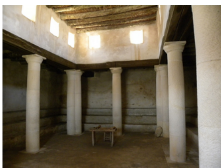
Reconstructed synagogue at Nazareth

Mark 6:1 Jesus left that place and came to his hometown, and his disciples followed him. 2 On the sabbath he began to teach in the synagogue, and many who heard him were astounded. They said, "Where did this man get all this? What is this wisdom that has been given to him? What deeds of power are being done by his hands! 3 Is not this the carpenter, the son of Mary and brother of James and Joses and Judas and Simon, and are not his sisters here with us?" And they took offence at him. 4 Then Jesus said to them, "Prophets are not without honour, except in their hometown, and among their own kin, and in their own house." 5 And he could do no deed of power there, except that he laid his hands on a few sick people and cured them. 6 And he was amazed at their unbelief.